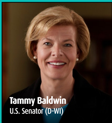
Tammy Baldwin U.S. Senator (D-WI)