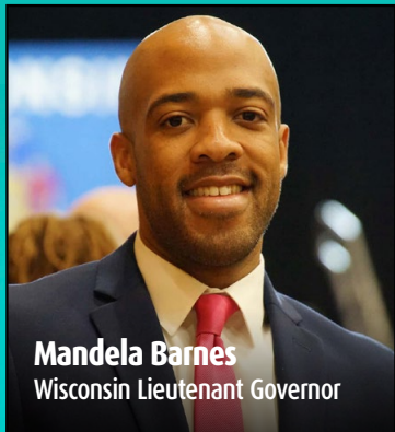
Mandela Barnes Wisconsin Lieutenant Governor