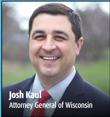
Josh Kaul Attorney General of Wisconsin