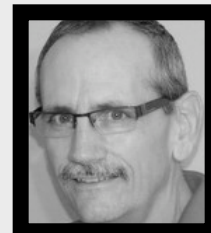
Jeff McCABE WI Assembly, District 5