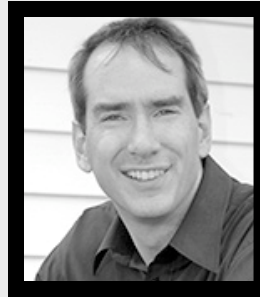
Jamie WALL U.S. Congress, 8th District