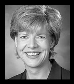
Tammy BALDWIN U.S. Senate

4 PM • November 1st • 1570 Elizabeth St. Green Bay Labor Council • Green Bay, WI